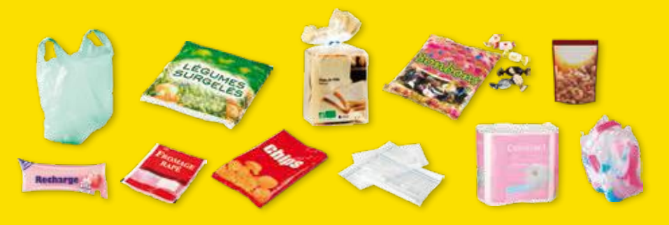
---- all bags, sachets, plastic films